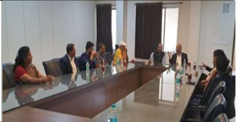
Fruitful discussion of Industry Experts along with AGCE Team Members.