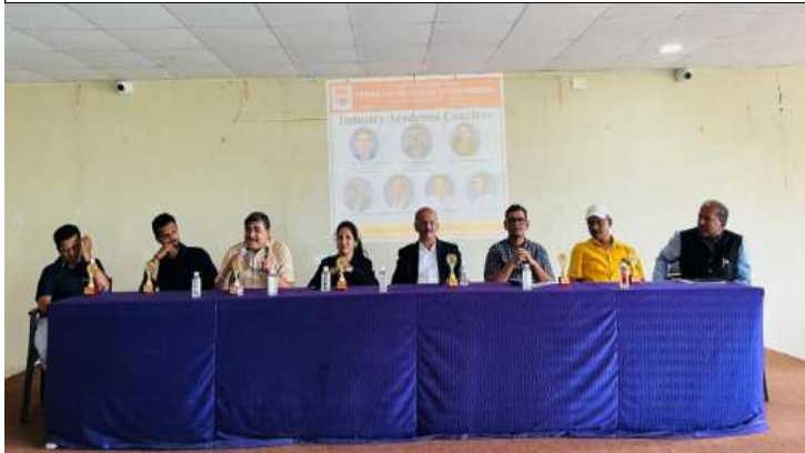
Student interaction with Industry Panel Members regarding various skills required in market