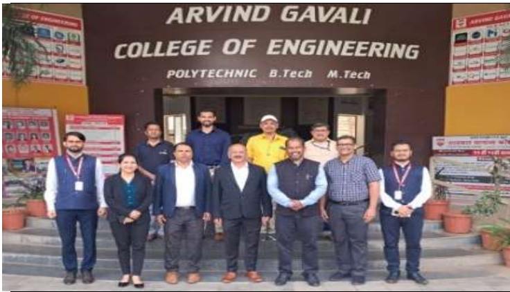
Group Photo of Industry Experts along with AGCE Team Members.