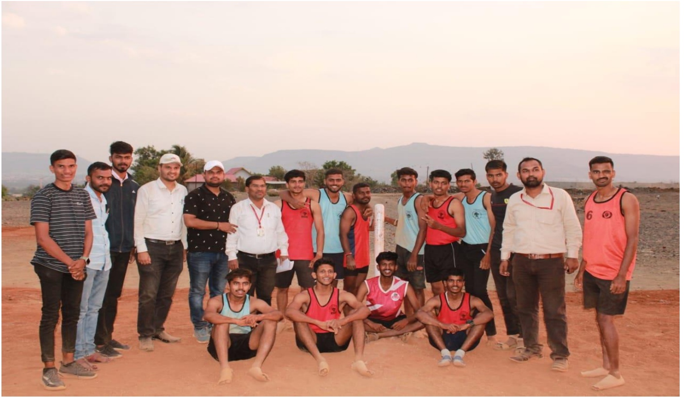
With winning team