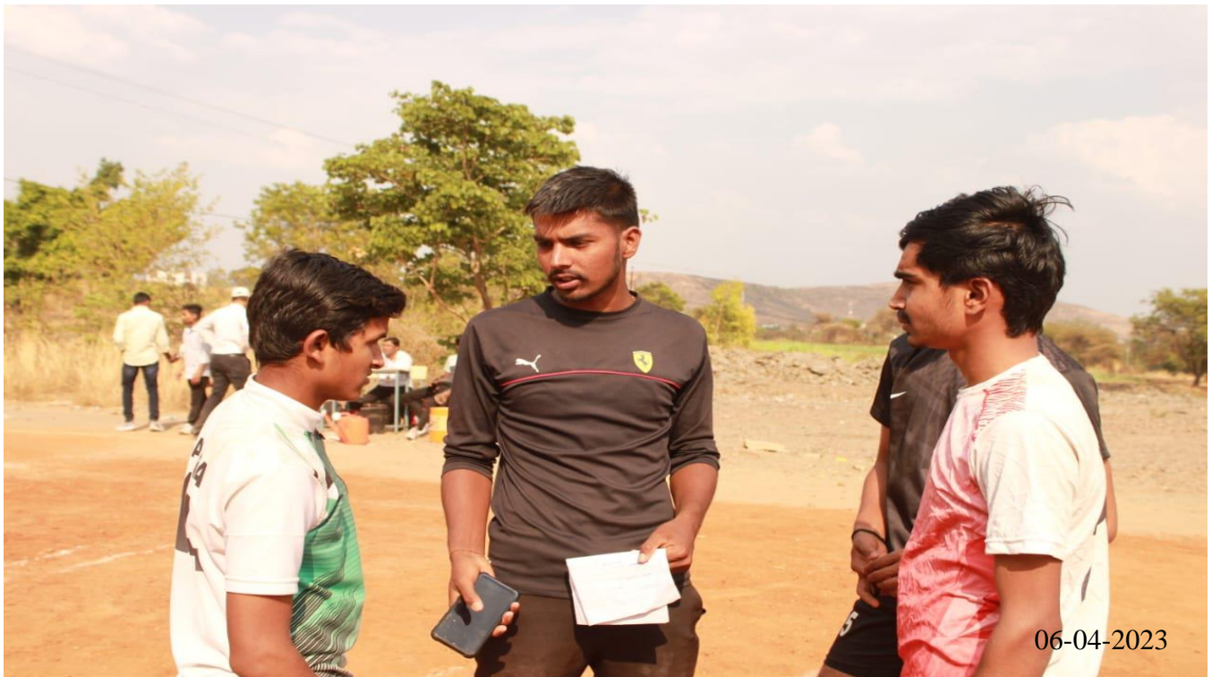
With Winner team and Runner up team.