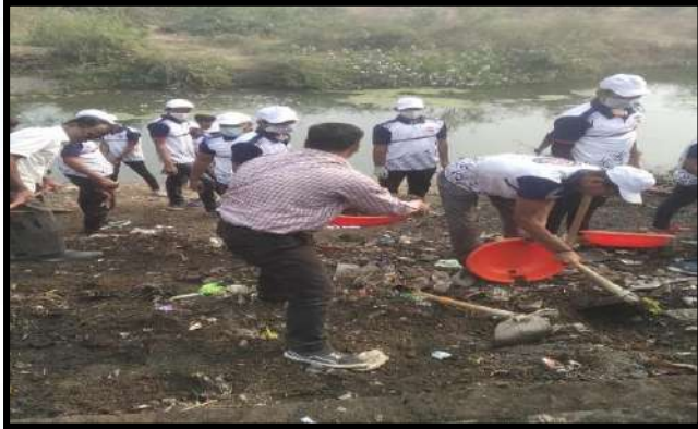
Students Swachata Abhiyan in NSS Camp at Jalgaon