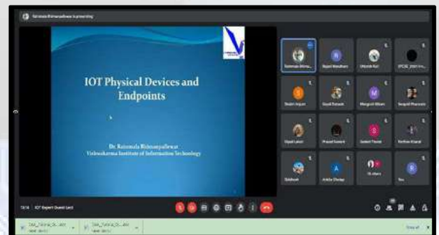
Online Expert lecture on IOT