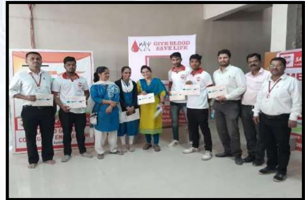
Blood donation camp in college on 23 rd Feb 2023