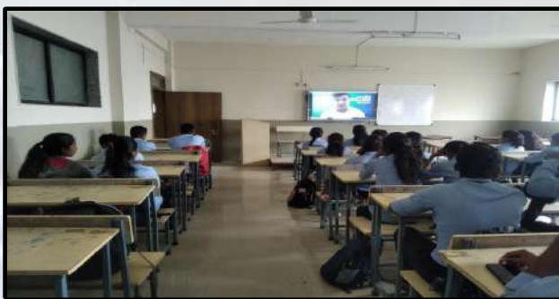
Online Expert Lecture on cloud computing

About Program: Hands-on Workshop on Web Designing and Development using HTML, CSS, PHP, JavaScript and MySQL was conducted from Wednesday, 14th June 2023 to Monday, 19th June 2023, by the Computer Science and Engineering Department in association with The Code Culture.