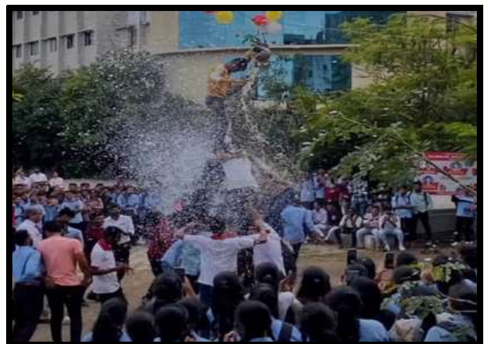
Dahi handi celebration