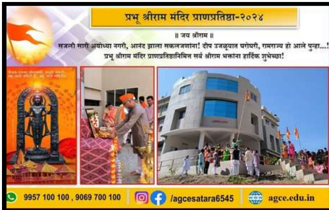
Prabhu shri ram mandir pranpratishta