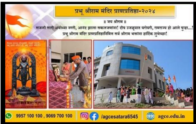
Prabhu shri ram mandir pranpratishtha