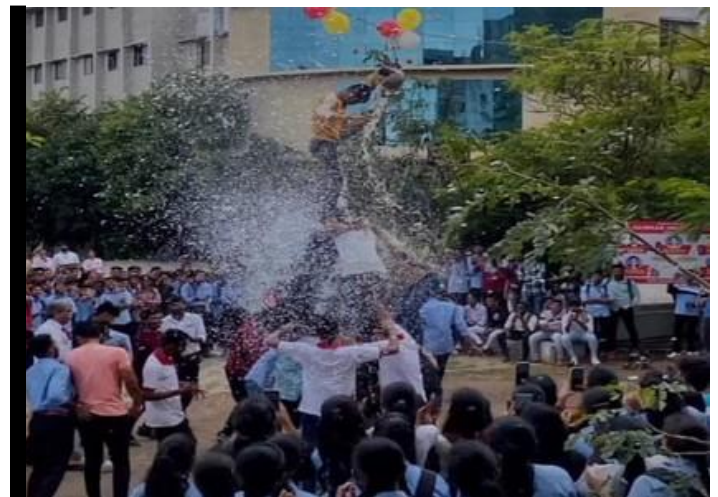
Dahi handi celebration