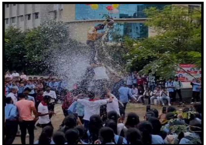
Dahi handi celebration