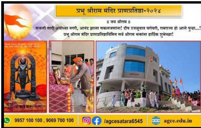
Prabhu shri ram mandir pranpratishta